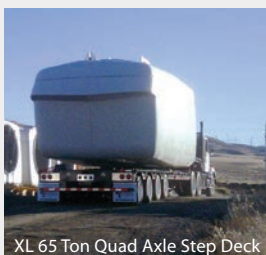
XL 65 Ton Quad Axle Step Deck

Featuring 80K webs and T-1 flanges , the XL SD is designed to withstand years of usage. XL's one-piece construction process results in stronger products. I-beams are made from one piece web and flange and then welded on all sides.