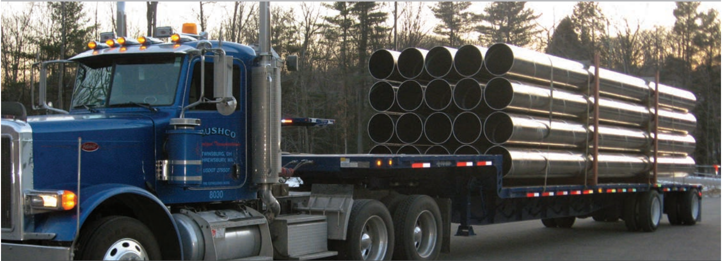
XL 2 Axle 70 Step Deck