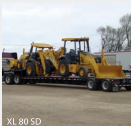
XL 80 SD