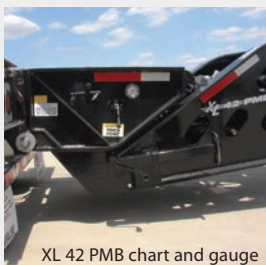
XL 42 PMB chart and gauge

XL Power Boosters are designed to fit with any XL trailer . The custom design is built to be retrofitted to existing trailers or mated with a new XL trailer, there is no need to buy a new Flip Axle.