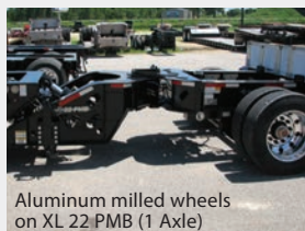
Aluminum milled wheels on XL 22 PMB (1 Axle)