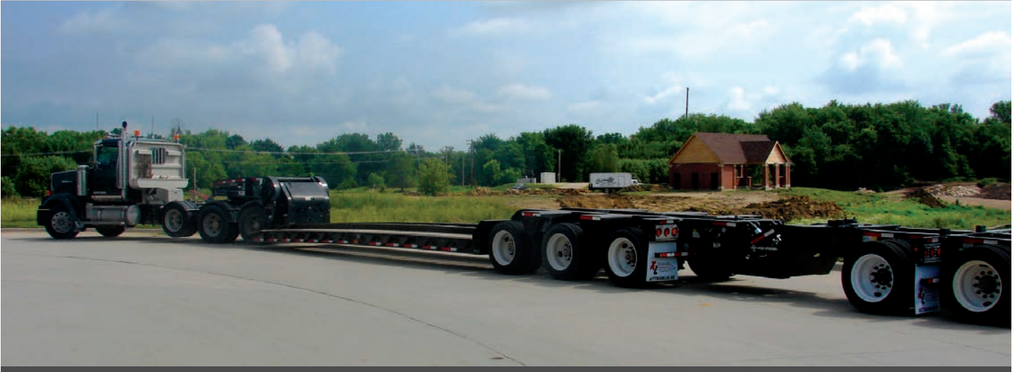
XL 100 CHDG featuring XL 42 Power Booster (2 Axle)