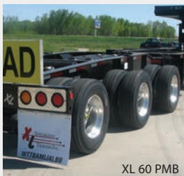
XL 60 PMB

The XL Power Boosters are capable of lifting the Flip Axle completely off the ground . This capability decreases turning radius , allows the trailer to go in reverse and allows you to avoid obstacles or traverse hills more effectively.