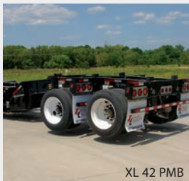
XL 42 PMB