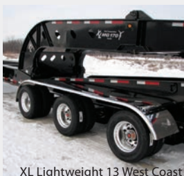
XL Lightweight 13 West Coast

The XL Lightweight 13 Axle combines an XL 3 Axle Jeep, 170 Mechanical Gooseneck and an XL 3 Axle Booster to create a revolutionary, custom-engineered multi-axle set-up .