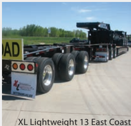
XL Lightweight 13 East Coast

The XL Lightweight 13 Axle weighs roughly 10,000 lb less than the market norm . 10,000 lb in weight savings results in 10,000 lb more payload. It hauls loads that would normally require 19 axles, on 13 axles.