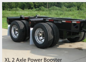
XL 2 Axle Power Booster