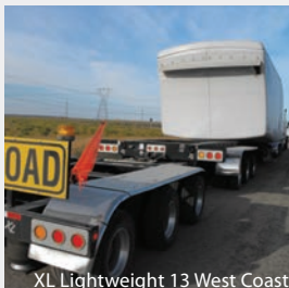
XL Lightweight 13 West Coast