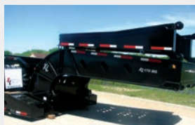
Hydraulic Assist Flip Neck