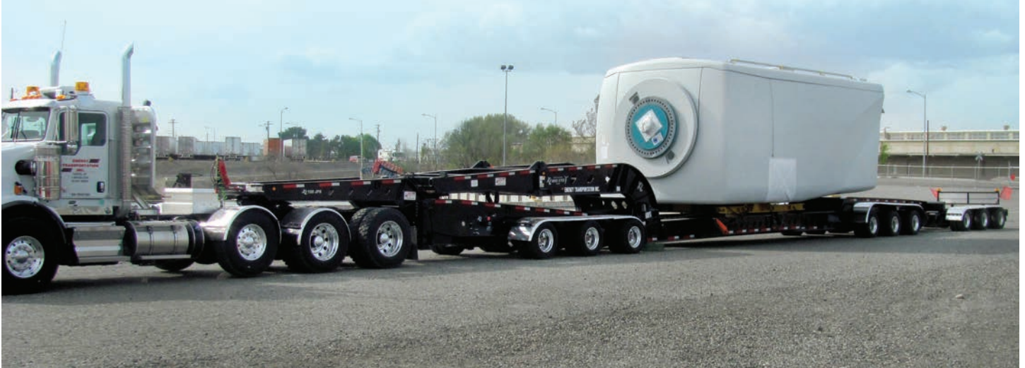
XL Lightweight 13 Axle West Coast