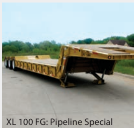
XL 100 FG: Pipeline Special

The XL Hydraulic Folding Gooseneck handles your heaviest hauling challenges. The low incline ramp makes it easy and safe to load and transport pavers, scrapers and other heavy equipment. The neck adjusts to uneven terrain without the use of blocks so you can load and unload almost anywhere.