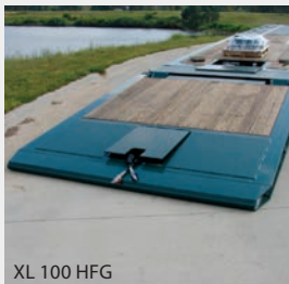
XL 100 HFG