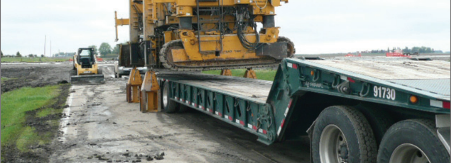
XL 110 Hydraulic Folding Gooseneck