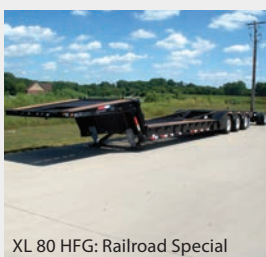
XL 80 HFG: Railroad Special

The XL HFG: Pipeline Special is engineered to handle demanding off road applications. It features a heavy-duty cross members, heavy-duty outriggers and top flange reinforcement.