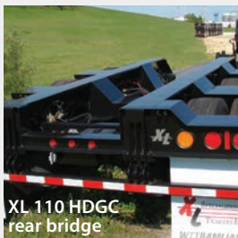
XL 110 HDGC rear bridge

The deep well was specifically designed for long booms, to eliminate the need to detach the lower boom section. The deep bucket well in the tail channel easily accommodates excavators. The lowered rear angle from deck to wheel area allows for easier loading of equipment over rear deck.