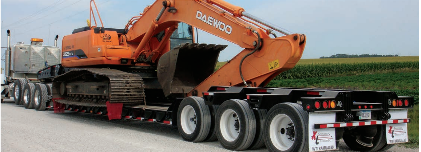
XL 110 Hydraulic Detachable Gooseneck: Construction