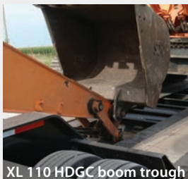
XL 110 HDGC boom trough