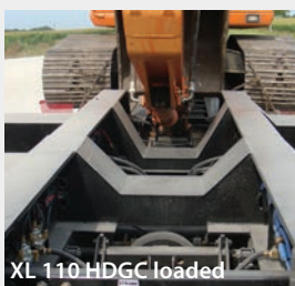
XL 110 HDGC loaded

XL hydraulic necks are wider and stronger than the industry standard. 1 \frac{3}{4} " Apitong decking allows for \frac{3}{4} " raised decking to keep tracks from slipping. Features such as heavy-duty removable outriggers and lowered heavy-duty bolsters combine for truly durable results.