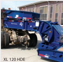
XL 120 HDE

7 position variable ride height makes hooking up to the truck easy. The different axle configurations , main deck widths, lengths and heights along with the ability to add a booster , provide superior versatility.