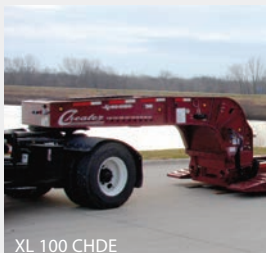
XL 100 CHDE

XL hydraulic necks are wider and stronger than the industry standard, offering increased stability for high center of gravity loads. The hydraulic support arm contacts truck frame rails only; there is no need to carry a 4 x 4 for blocking the neck.