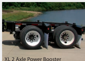
XL 2 Axle Power Booster