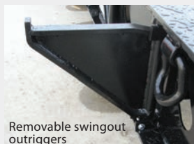
Removable swingout outriggers