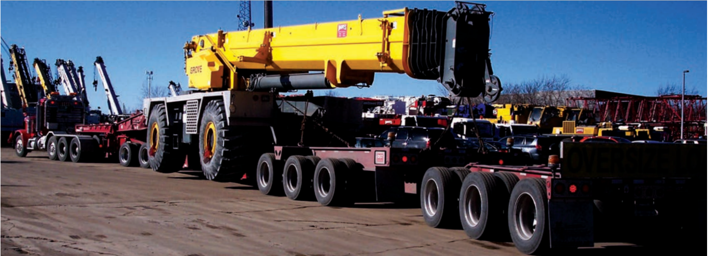
XL 150 Hydraulic Detachable Gooseneck 3+3+3