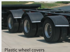
Plastic wheel covers