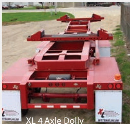
XL 4 Axle Dolly

With a 140° total load platform travel and 38" load platform height , these Dollies transport Bridge beams, pre-stressed concrete abutments, crane booms and asphalt plant chimney's, among other materials.