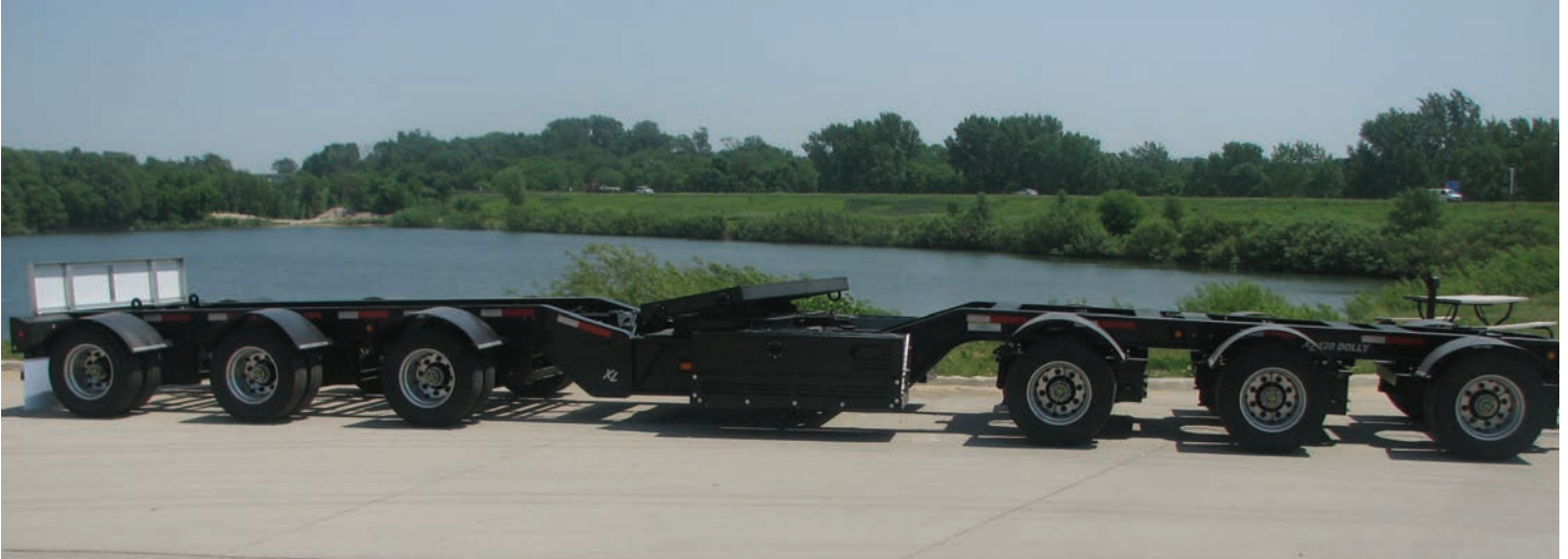
XL 6 Axle Dolly