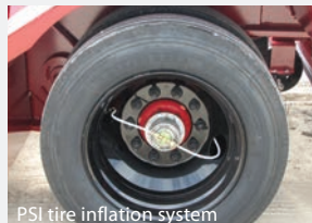
PSI tire inflation system