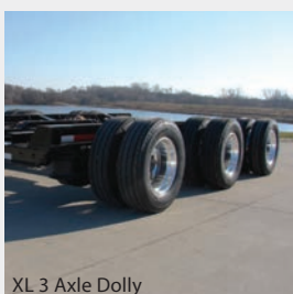
XL 3 Axle Dolly

Built with XL's one-piece construction process results in stronger products. I-beams made from one piece web and flange and then welded on all sides. Built with proven XL quality, the XL Dolly will stand up to your hauling challenges.