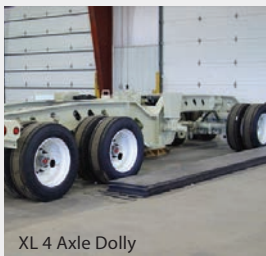
XL 4 Axle Dolly