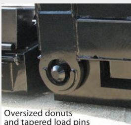
Oversized donuts and tapered load pins

The Cheater was custom-designed by XL engineers with the goal of saving drivers valuable time while increasing product flexibility . The innovative technology and design has proved useful in many applications, on many different models of XL trailers.