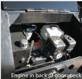
Engine in back of gooseneck

The Cheater's multiple king pin settings allow for variable swing clearances. The seven different ride height positions allow you to change the height and ground clearance of your trailer.