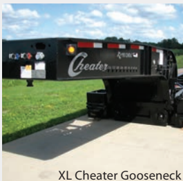
XL Cheater Gooseneck