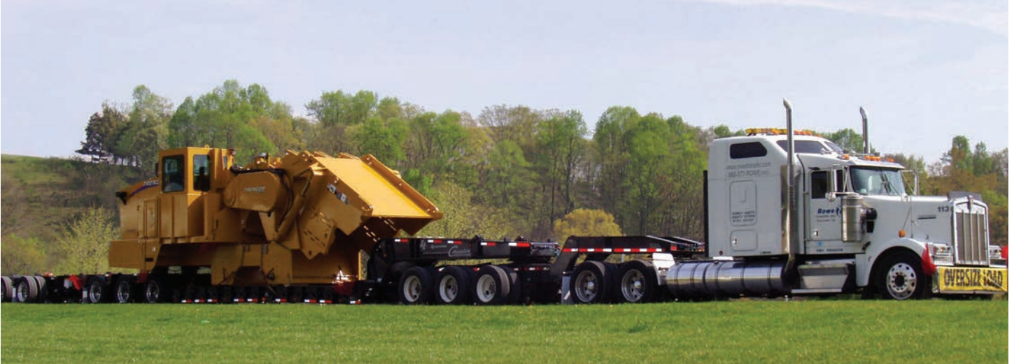
XL120 Cheater Hydraulic Detachable Gooseneck